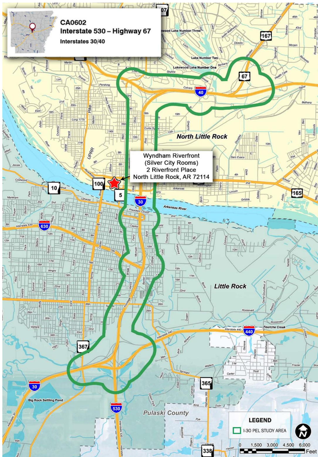
Figure 1. Public Meeting #6 Site Location