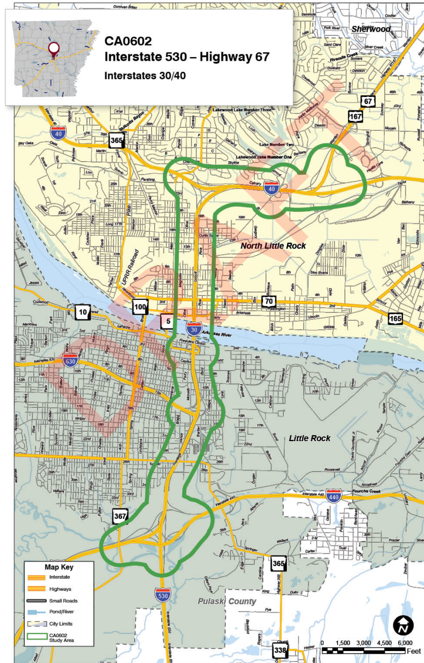
Figure 1. I-30 PEL Study Area