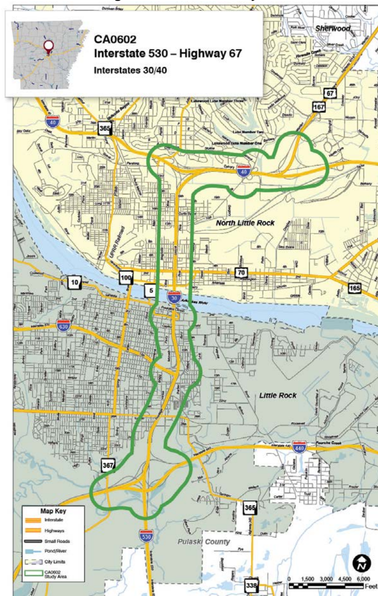
Figure 1. I-30 PEL Study Area

The recommendations identified in the I-30 PEL Study will be moved into subsequent stages of project development in accordance with planning guidelines established in Moving Ahead for Progress in the 21st Century (MAP-21), in the LRMTTP, and in the CARTS Agreement of Understanding between Metroplan and the local jurisdictions and transit authorities (i.e., Metroplan Policy on Freeways and Expressways ), as described in the I-30 PEL Study Purpose and Need Technical Report . With a view towards achieving consistency with local and regional planning efforts, it is anticipated that the PEL recommendations will be submitted to Metroplan to inform future updates/amendments to the LRMTTP financially constrained plan and to the CARTS Transportation Improvement Program (TIP), as well as to the AHTD to inform future Statewide Transportation Improvement Program (STIP) updates/amendments.