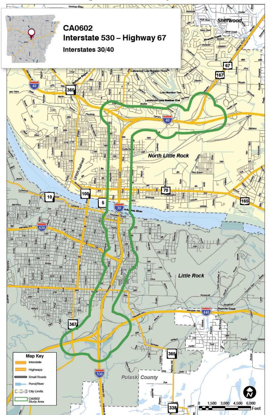
Figure 1. I-30 PEL Study Area