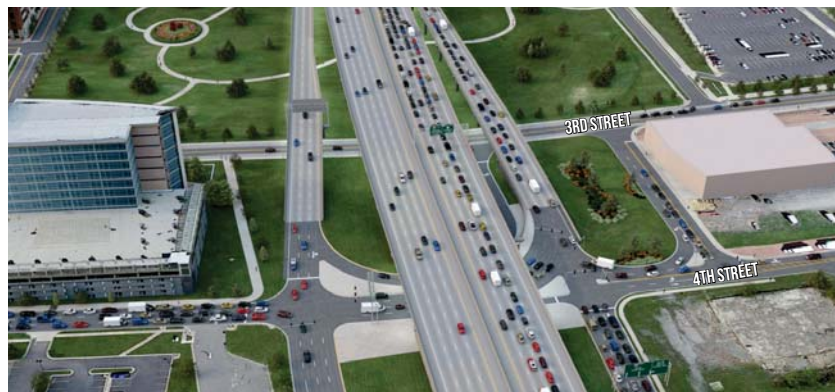
8 GENERAL PURPOSE LANES ALTERNATIVE