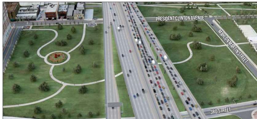
8 GENERAL PURPOSE LANES ALTERNATIVE