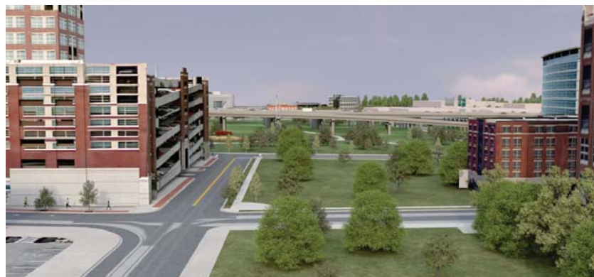
SPLIT DIAMOND INTERCHANGE ALTERNATIVE