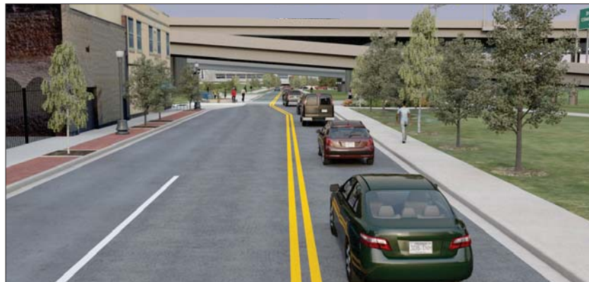
SINGLE POINT URBAN INTERCHANGE ALTERNATIVE