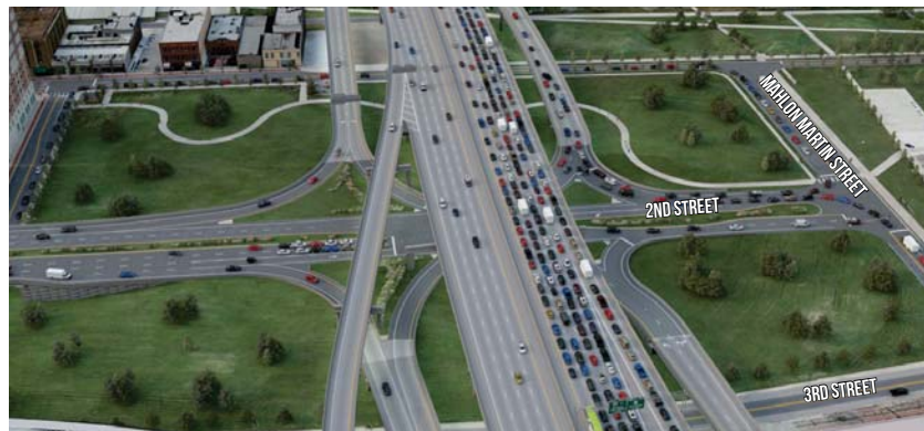
8 GENERAL PURPOSE LANES ALTERNATIVE