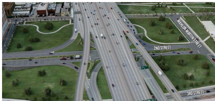
6-LANES WITH COLLECTOR-DISTRIBUTOR LANES ALTERNATIVE