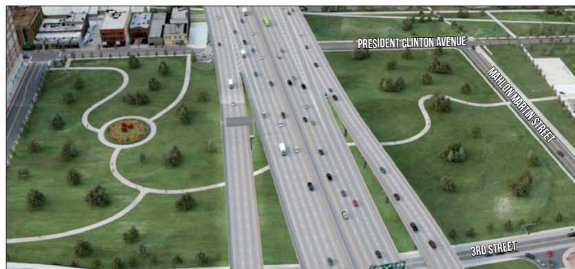
6-LANES WITH COLLECTOR-DISTRIBUTOR ALTERNATIVE