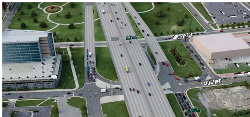
6-LANES WITH COLLECTOR-DISTRIBUTOR ALTERNATIVE