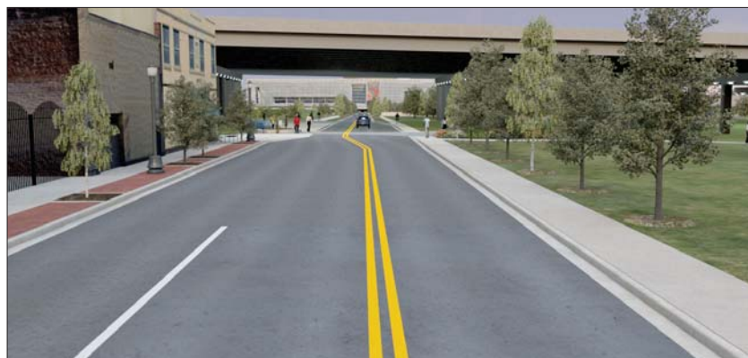
SPLIT DIAMOND INTERCHANGE ALTERNATIVE