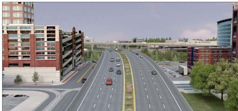
SINGLE POINT URBAN INTERCHANGE ALTERNATIVE