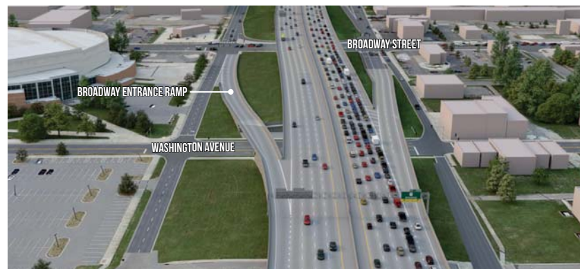
8 GENERAL PURPOSE LANES ALTERNATIVE