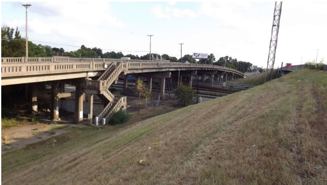
FIGURE 3: BRIDGE No. 02001 VIEW TO THE EAST

The bridge accommodates two 10-foot wide travel lanes in each direction, along with 4-foot wide sidewalks, and 27-inch wide railings, for a total width of 52.5 feet. The vertical crest is 33.5 feet. The bridge superstructure is composed of continuous steel I-beam spans and reinforced concrete deck girders (RCDG). The substructure consists of 19 concrete bents on concrete piles with concrete abutments and slabs. Twenty spans are supported by the 19 bents. The bridge contains two stairways: one on the east side and one on the west side. The west stairway is a top overrun design with three flights and two intermediate landings. Each successive flight turns 180 degrees at the landing, giving the stairway an "S" shape configuration. The flights have dual concrete handrails. The east stairway is a two flight straight run with a single intermediate landing. There are 32 recessed galvanized metal electric lighting units that line the east and west courses of the roadway. Large concrete posts incorporated into the balustrade accommodate the units. There are no functioning lighting units.