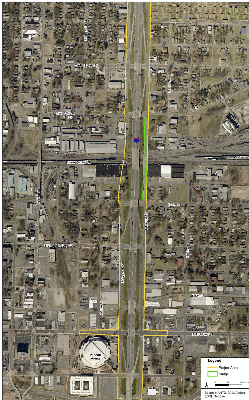
FIGURE 2: BRIDGE No. 02001 SITE MAP