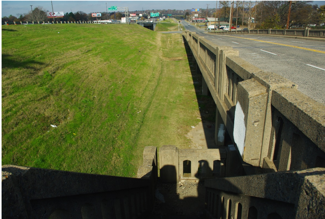
FIGURE 5: BRIDGE No. 02001 SHOWING BALUSTRADE AND LIGHT FIXTURE